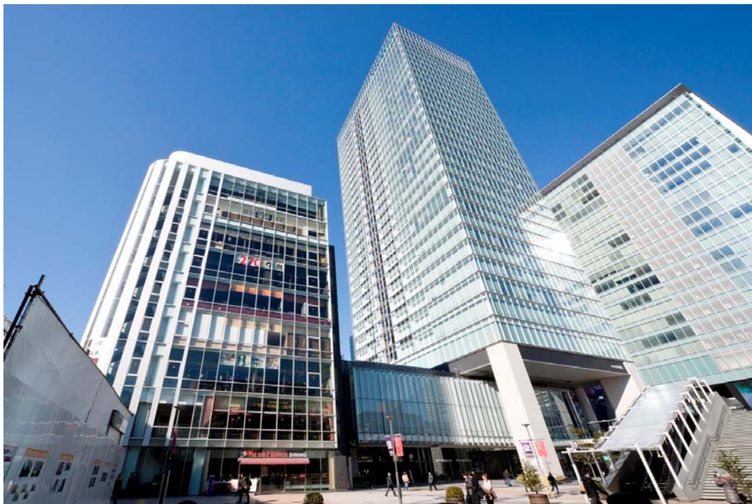
Akihabara Daibiru · Ekimae Plaza ( above, below left )